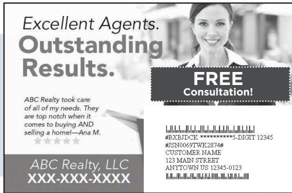
SCANNED MAIL PIECE